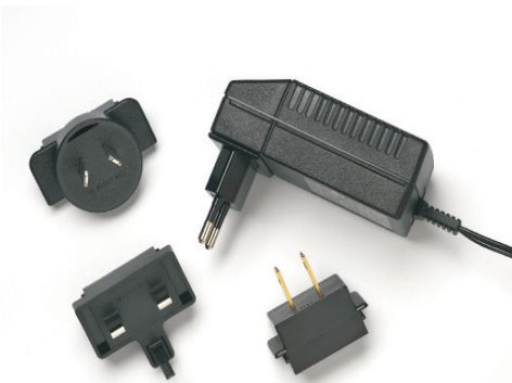
Worldwide compatible AC adapter/charger (SNT-121A)