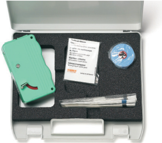
Ock-10 Optical Connector Cleaning Kit (accessory)