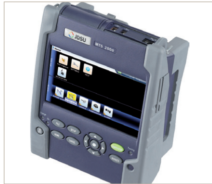
For more fiber testing and certification capabilities, combine the Certifier40G with one of the market-leading JDSU fiber testers, such as the T-BERD®/MTS-2000.

Visit www.jdsu.com/go/Certifier40G for more information, vendor endorsements, and product videos.