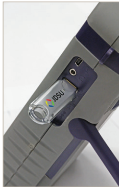
USB flash drive supports transferring test results