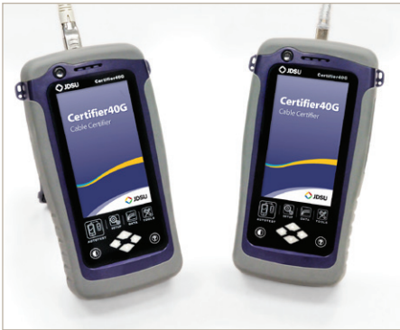
Two complete units minimize time initiating, naming, and saving results