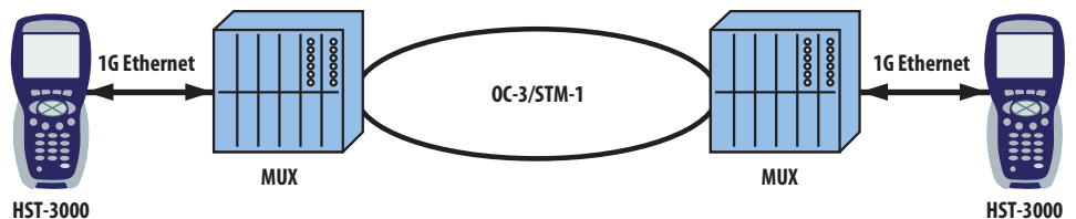
Figure 2. Class-of-service testing using the HST-3000 Ethernet SIM with the Multiple Streams option

The HST-3000 IP Video option is a video test suite specifically designed to meet the needs of the field technician who is responsible for the provisioning or turn-up of IP Video services that carry video program content over an Access network. Test access includes the 2-wire ADSL interface or the Ethernet 10/100 interface at the DSL modem or FTTx residential gateway. The test suite includes set top box (STB) emulation with signaling support for broadcast video (IGMP) and VOD (RTSP). Video transport stream analysis is provided as well as video quality of service measurements, including packet jitter, packet loss, IGMP latency, and program clock reference (PCR) jitter analysis.