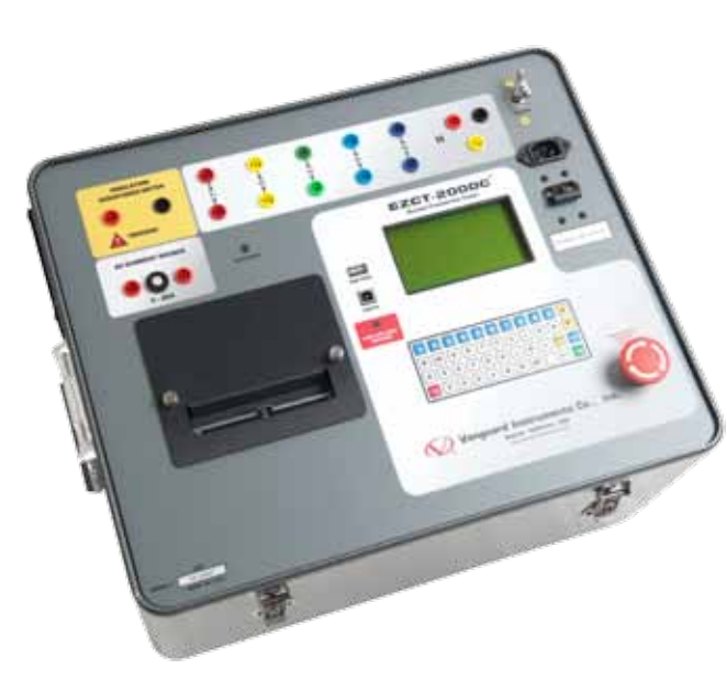
EZCT-2000C Plus connections