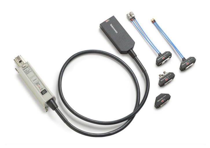
P7630 Low Noise TriMode Probe