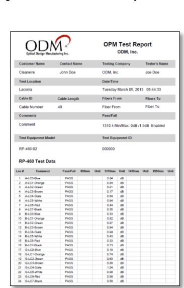
OPM Test Report Screen

with data storage and USB download capabilities, as well as the DLS 355 Laser Light Source and DLS 350 LED Light Source. Image Manager Analysis Software provides customized close-out documentation.