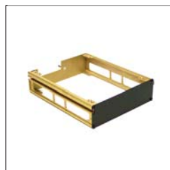
530 - Single Slot Filler Module