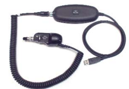
545 - USB Video Inspection Probe