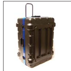
524 Deluxe Hard Case (case only)