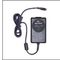
511 - AC charger/adaptor