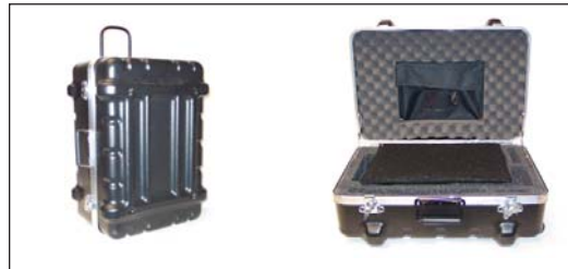
520 - SBA Hard Transit Case