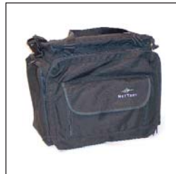
522 - Soft Bag