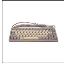
507 - PS/2 Keyboard (US Layout)