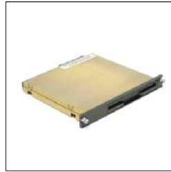
502 - Floppy Drive