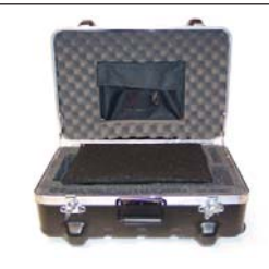
521 - MBA Hard Transit Case