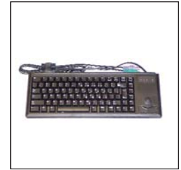
506 - PS/2 Keyboard with Trackball (US Layout)