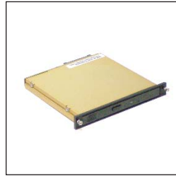
501 - CD/RW Drive