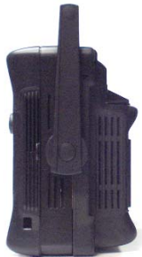
Mid Bay Adapter (MBA)