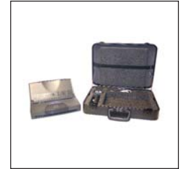
515 - Portable External Printer