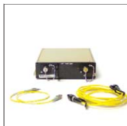
520 - ORL Module