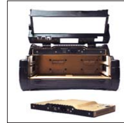
513 - AC Power Module (Module Only)