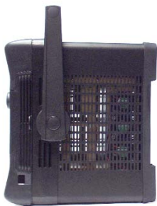
Large Bay Adapter (LBA)