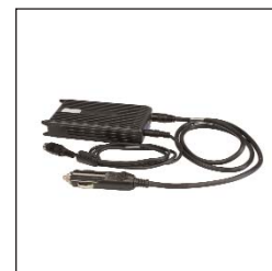
4500-AUTO - Cigarette lighter charger for SBA and MBA (DC only)