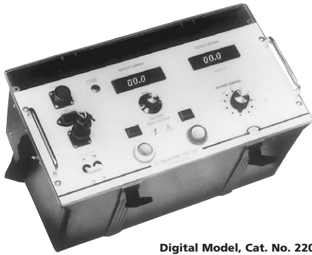
Digital Model, Cat. No. 220070