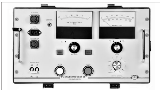
Front panel of Analog Model, Cat. No. 220124

The insulation resistance test is often referred to as a "spot check," and is performed by applying a predetermined voltage to the unit under test, holding it until the apparent leakage current becomes stable and recording the readings with adjustments for temperature. This test is especially applicable to low-capacitance units under test.