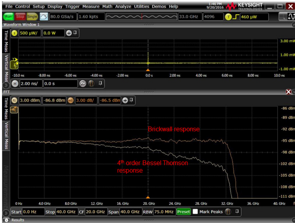
Figure 4. The N7004A used with an Infiniium real-time oscilloscope offers user-selectable hardware Brickwall filter and 4th order Bessel Thomson filter, making the system ideal for reference receiver testing of industry standards or characterizing raw response of optical transmitters.