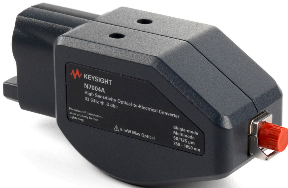
Figure 1. The N7004A is a high-sensitivity 33 GHz O/E converter for Infiniium real-time oscilloscopes.