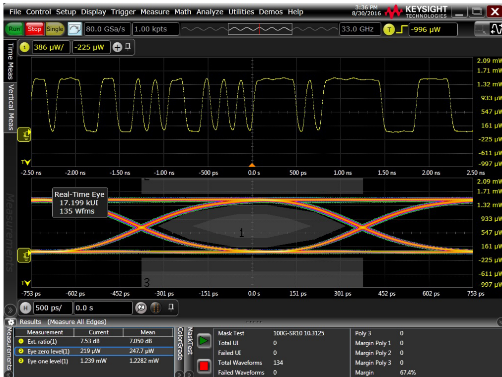
Figure 3. A full suite of optical measurement software is built into the Infiniium baseline software.