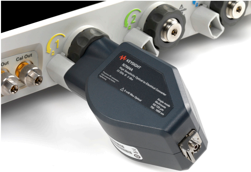
Figure 2. The N7004A comes in a compact form factor that is plugged directly into the AutoProbe II probe interface of the Infiniium oscilloscope.

The adapter provides from DC to 33 GHz of electrical bandwidth. When used with an Infiniium V-Series or Z-Series 33 GHz oscilloscope, the N7004A allows users to view optical streams at speeds up to 28 Gbps, making this the ideal solution for characterizing or troubleshooting high-speed optical signals in the system level testing. The N7004A with an Infiniium real-time oscilloscope is the ideal solution for users who want to see the unfiltered response of optical transmissions as well.