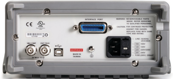
Model 2110 rear panel.

Input bias current: <30pA at 25°C. Input protection: 1000V all ranges (2W input). AC CMRR: 70dB (for 1kΩ unbalance LO lead). Power Supply: 100V/120V/220V/240V. Power Line Frequency: 50/60Hz auto detected. Power Consumption: 25VA max. Digital I/O interface: USB-compatible Type B connection, GPIB (option). Environment: For indoor use only. Operating Temperature: 0° to 40°C. Operating Humidity: Maximum relative humidity 80% for temperature up to 31°C. Storage Temperature: –40° to 70°C. Operating Altitude Up to 2000 m above sea level. Bench Dimensions (with handles and bumpers): 107 mm high × 252.8 mm wide × 305 mm deep (3.49 in. × 9.95 in. × 12.00 in.). Weight: 2.23 kg ( 4.92 lbs.). Safety: Conforms to European Union Low Voltage Directive, EN61010-1. Measurement Cat I 1000V and CAT II 600V. EMC: Conforms to European Union Directive 89/336/EEC, EN61326-1. Warranty: Three years.