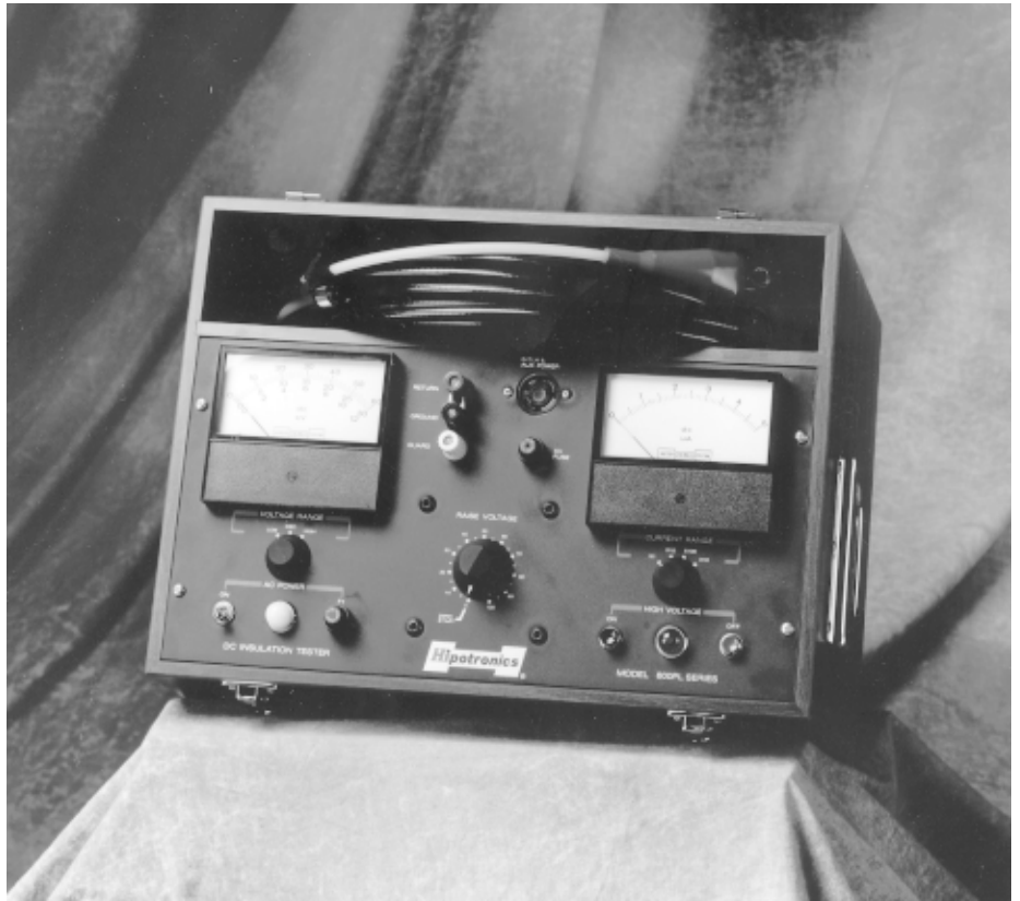
Model 880PL DC Hipot Tester