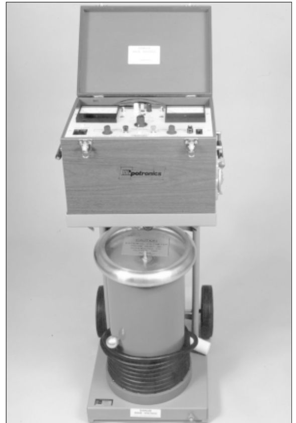
Model 100 HVT AC Hipot Tester

A triple range current meter enables low current readings of 0 to 1/10/100 mA on the 100 HVT. A triple range voltmeter is connected directly across the output for maximum accuracy. The 100 HVT has a 50 kV tap that is used for bucket liner testing and other low voltage, high current test requirements.