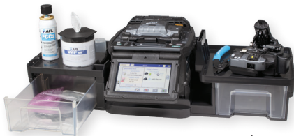
In Work Tray