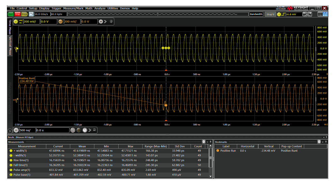
Figure 6. After clicking the view button, Fault Hunter will take you to the error it found