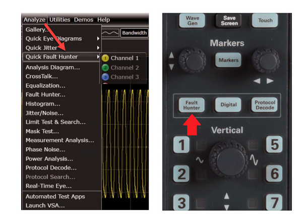
Figure 2. Using an EXR-Series oscilloscope, select Fault Hunter from the Analyze menu (at left) or use the front panel shortcut key (at right)

Start by pressing the Quick Fault Hunter key on the front panel; see Figure 2. Fault Hunter runs a quick 30-second statistical analysis on a normal signal to determine the mean and standard deviation of waveform measurements. Fault Hunter automatically locates problem signals by triggering and flagging a signal that falls outside the set thresholds before beginning the next test.