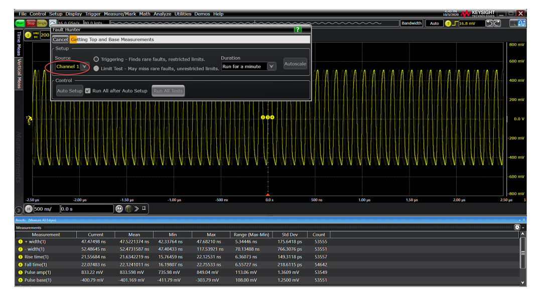
Figure 3. Any one channel can run Fault Hunter to produce a baseline of the mean and standard deviation of common measurements

Fault Hunter runs on any channel you choose and begins the analysis process. The setup screen displays Fault Hunter gathering a baseline of the mean and standard deviation of common measurements for the waveform's pulse width, rise time, fall time, and more. The system collects this information for about 30 seconds.